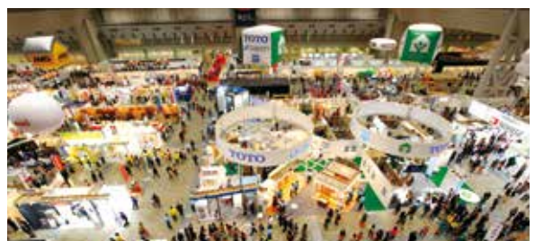
The 33th Japan Kenzai Fair

This exhibition is a major event attracting over 200 manufacturers exhibiting at the show every time it is held. Over 24,000 visitors come to the show and the amount of sales exceeds 40 billion yen.