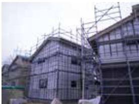
Public housing for the disaster-stricken area located in the Arata district in Soma city, Fukushima prefecture

Since April 2012, JK group has participated in the construction of more than 600 units of public housing in total (wooden single-family home) for the disaster-stricken areas.