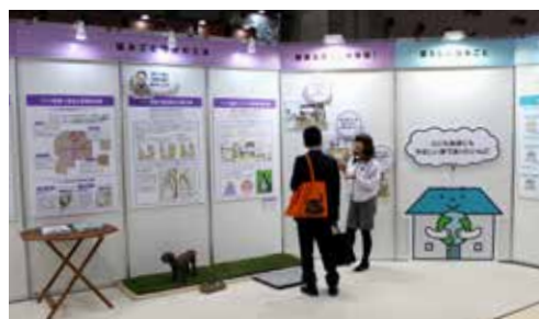
Various Consultation Booth

This exhibition is a major event attracting over 200 manufacturers exhibiting at the show every time it is held. Over 20,000 visitors come to the show and the amount of sales exceeds 40 billion yen.