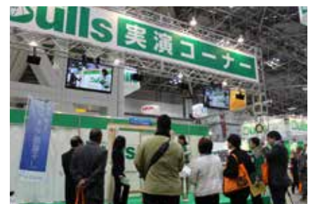
Bulls products Booth