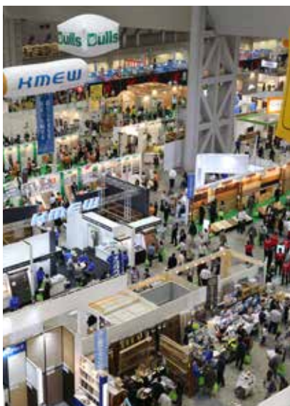
The 31th Japan Kenzai Fair