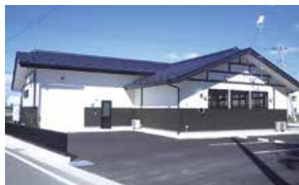
Soma city in Fukushima Prefecture, a community center for the residents